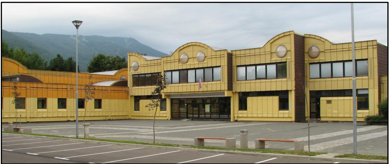
Primary school Tabor I Maribor

Primary school Tabor I Maribor, Municipality of Maribor was successful using Cohesion funds in the amount of 568.360,75 EUR.